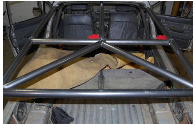
Fig 12 – 5RIC rear complete

•5801 Pleasant Valley Rd •Platteville, WI 53818 •Phone: (608) 348-4880 •Web: http://4xinnovations.com •Email: Adam@4xinnovations.com