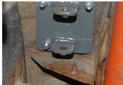
Fig 6 – Lower B pillar mounting plate orientation