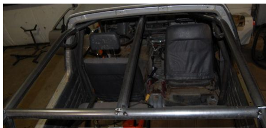
Fig 11 – 5RIC Rear Half being installed.