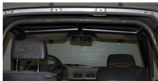
Fig 10 – Front Half Assembled