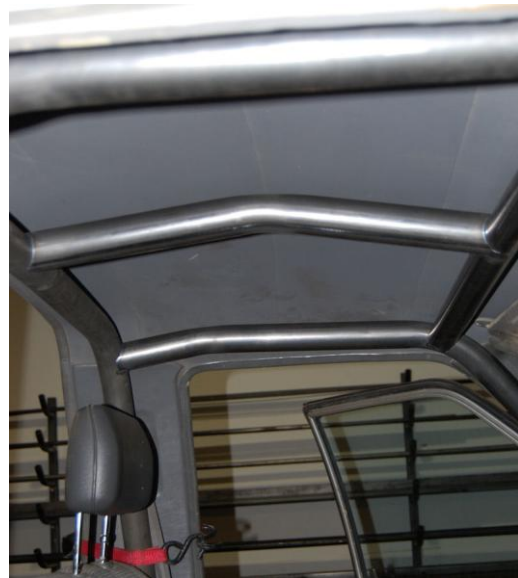
Fig 9 – Front Half Assembled