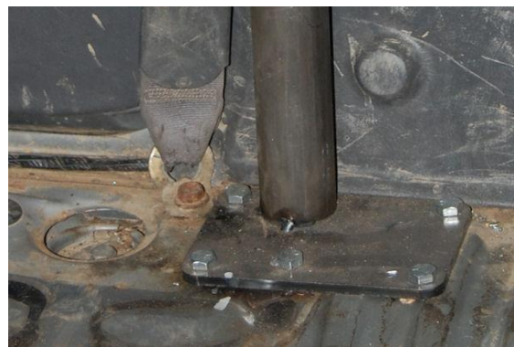
Fig 5 – Upper B pillar mounting plate orientation