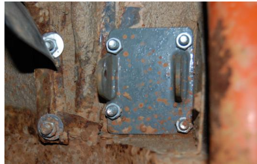
Fig 8 – Lower C pillar mounting plate orientation