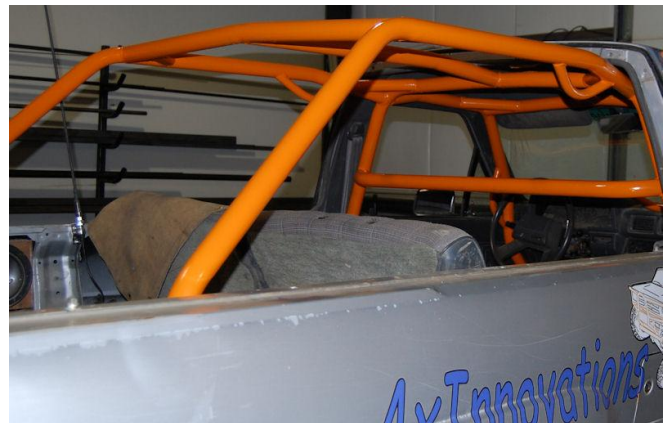
Fig 13 – 4RIC rear complete

Congratulations You're done! Enjoy your new roll cage.