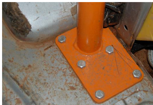
Fig 7 – Upper C pillar mounting plate orientation