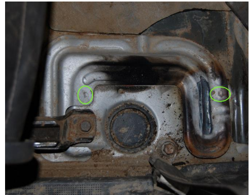
Figure 2 – Vibration Damper