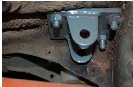
Fig 4 – A pillar lower foot alignment